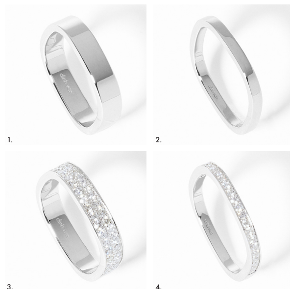
1. Square wedding band 4mm – 2 300 € • 2. Square wedding band 2mm, platinum – 1 450 € • 3. Square wedding band 4mm, Platinum and diamonds – 4 300 € • 4. Square wedding band 2mm, platinum and diamonds – 2 100 €.

Created in 1965, the dinh van square wedding band embodies the boldness of a designer who has challenged the conventions of jewelry since his early days. Jean Dinh Van imagined a ring with an unexpected geometry: a softened, refined square, designed for everyday wear. A simple gesture, a powerful idea — and a signature that has become iconic. For lovers of design and symbols, the square wedding band is much more than a piece of jewelry: it is a declaration of independence, a tribute to the freedom to love differently. Elegant and modern, it stands the test of time without ever betraying itself. Its square shape naturally hugs the finger, offering unparalleled comfort — “because it’s not round.” Practical, it doesn’t twist; stable, it remains true to its line, as well as its promises. The square, a symbol of stability and balance. A wedding ring that, for sixty years, has sealed the most unique unions.